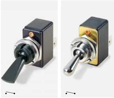
C0600HD - - - C0600CC - - -