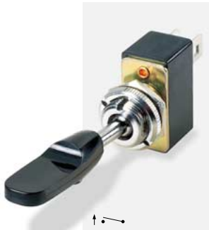
C0602SC - - -